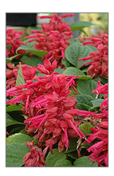
Vista Rose Salvia flowers

Vista Rose Salvia has masses of beautiful spikes of rose flowers with pink spurs rising above the foliage from early summer to mid fall, which are most effective when planted in groupings. The flowers are excellent for cutting. Its fragrant narrow leaves remain green in colour throughout the season.