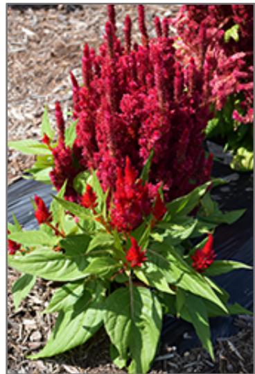
Fresh Look Red Celosia in bloom