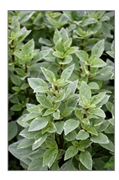
Lemon Basil foliage

Lemon Basil will grow to be about 3 feet tall at maturity, with a spread of 24 inches. When grown in masses or used as a bedding plant, individual plants should be spaced approximately 18 inches apart. This fast-growing annual will normally live for one full growing season, needing replacement the following year.