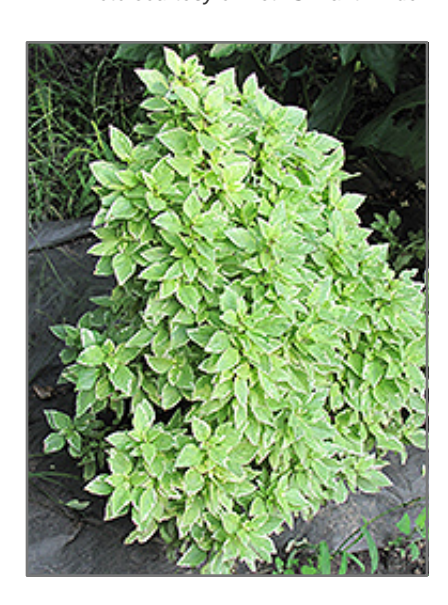
Lemon Basil