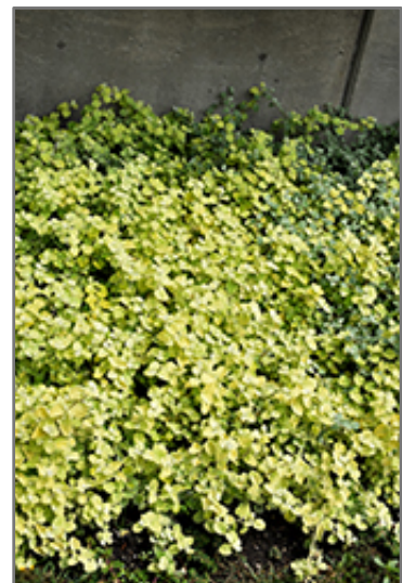
Lemon Licorice Plant