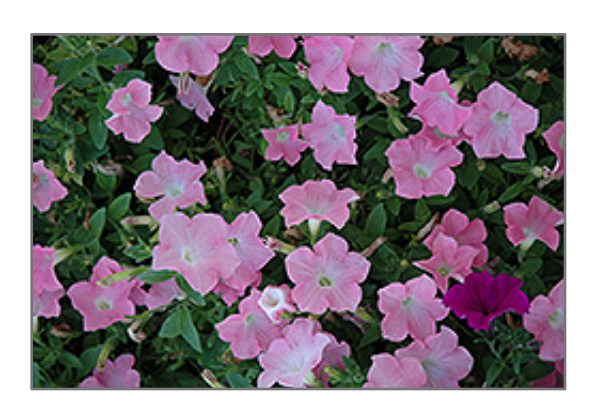
Easy Wave Shell Pink Petunia flowers

This selection will stand out, with fast growing plants that bloom freely all season, in landscapes or containers; tolerates both heat and cooler conditions very well; tends to be more mounded with a controlled spread, and excellent uniformity