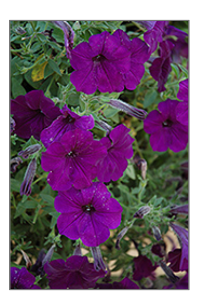
Fame Blue Petunia flowers

Fame Blue Petunia is clothed in stunning navy blue trumpet-shaped flowers at the ends of the stems from mid spring to mid fall. Its pointy leaves remain green in colour throughout the season.