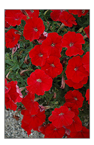
Famous Firestorm Petunia flowers

Famous Firestorm Petunia is covered in stunning scarlet trumpet-shaped flowers with gold centers at the ends of the stems from mid spring to mid fall. Its pointy leaves remain green in colour throughout the season.