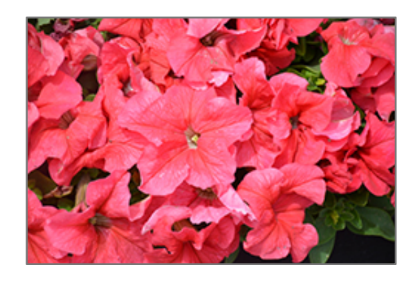
Limbo Salmon Petunia flowers

Hardiness Zone: (annual) Group/Class: Limbo Series