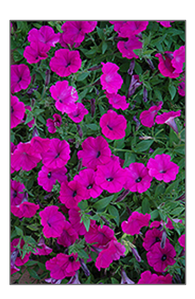
Shock Wave Purple Petunia flowers

Shock Wave Purple Petunia is blanketed in stunning purple trumpet-shaped flowers at the ends of the stems from mid spring to late summer. Its pointy leaves remain green in colour throughout the season.