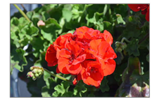
Americana Bright Red Geranium flowers