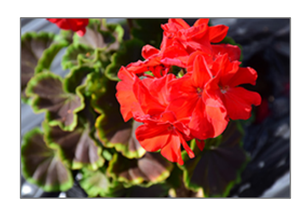
BullsEye Red Geranium flowers

This series presents rich chocolate foliage that contrasts the brightly colored flowers; excellent for mixed containers, with the foliage adding interest; vigorous and adaptable with a nice mounded habit