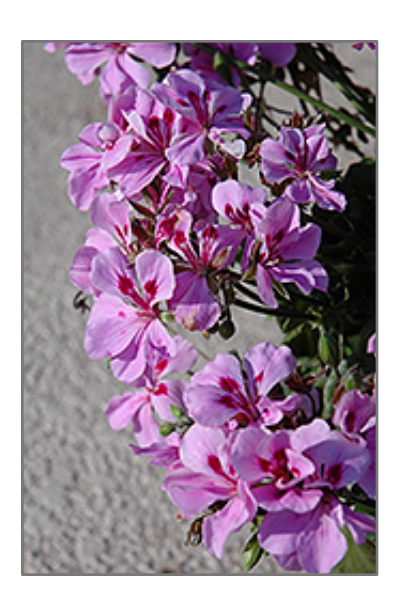
Precision Dark Lavender Ivy Leaf Geranium flowers

Precision Dark Lavender Ivy Leaf Geranium features bold clusters of lightly-scented lilac purple flowers with a red blotch at the ends of the stems from late spring to early fall. The flowers are excellent for cutting. Its serrated pointy palmate leaves remain green in colour throughout the year.