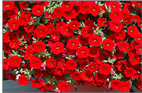
Cabaret Bright Red Calibrachoa flowers

This plant will require occasional maintenance and upkeep. Trim off the flower heads after they fade and die to encourage more blooms late into the season. It is a good choice for attracting bees and hummingbirds to your yard, but is not particularly attractive to deer who tend to leave it alone in favor of tastier treats. It has no significant negative characteristics.