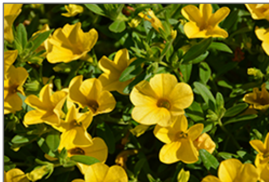
Cabaret Deep Yellow Calibrachoa flowers

Cabaret Deep Yellow Calibrachoa is recommended for the following landscape applications;