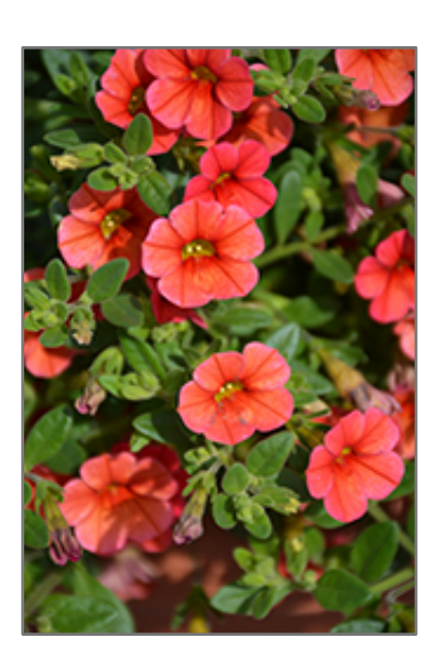
Caloha Orange Calibrachoa flowers

A beautiful semi-trailing variety perfect for sunny hanging baskets and patio containers; vigorous plants produce brightly colored blooms over small green foliage; heat tolerant and easy to grow; low maintenance-deadhead to promote new blooms