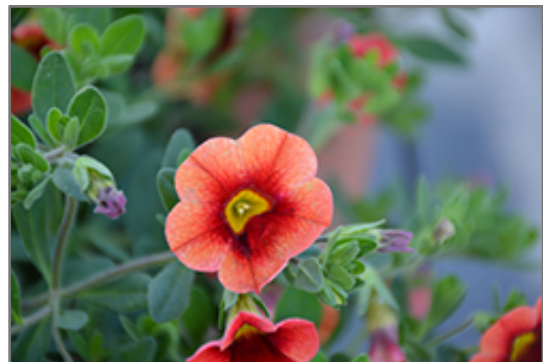
Celebration Mandarin Calibrachoa flowers