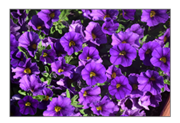
Lindura Purple Calibrachoa flowers

A naturally compact series that features beautifully colored mini blooms on small green foliage; a wonderful trailing selection for patio containers and hanging baskets; easy to grow, requiring little to no maintenance