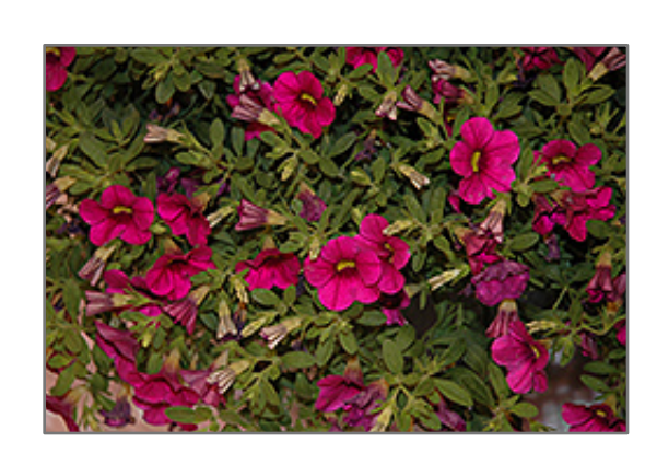
Million Bells Cherry Pink Calibrachoa flowers

Free flowering with a compact trailing habit, this series is ideal for hanging baskets, patio containers, beds and borders; continuous blooming from late spring to autumn; low maintenance and easy to grow