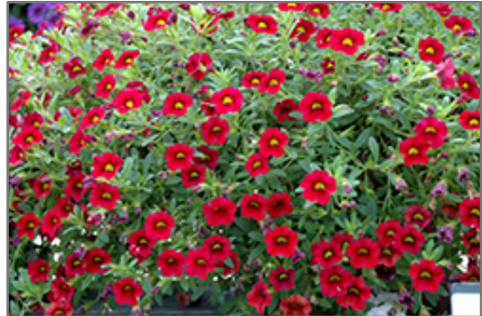
MiniFamous Compact Dark Red Calibrachoa flowers

MiniFamous Compact Dark Red Calibrachoa is recommended for the following landscape applications;