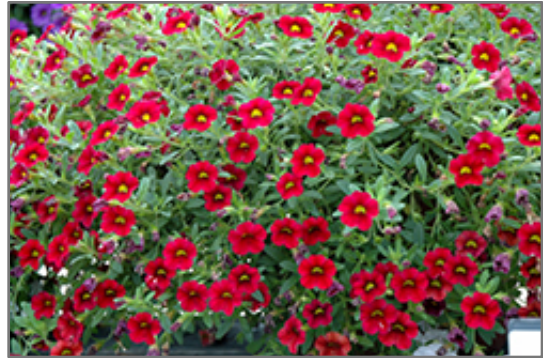
MiniFamous Compact Dark Red Calibrachoa flowers

MiniFamous Compact Dark Red Calibrachoa is recommended for the following landscape applications;