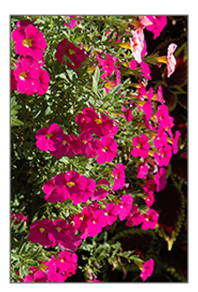
MiniFamous Pink Calibrachoa flowers

An outstanding series with large colorful flowers; vigorous and busy, with a semi-trailing habit; a stellar performer with a summer-long display of color