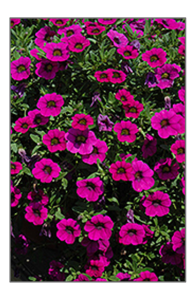
MiniFamous Purple Calibrachoa flowers

An outstanding series with large colorful flowers; vigorous and busy, with a semi-trailing habit; a stellar performer with a summer-long display of color