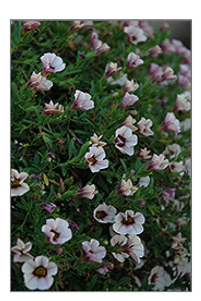
MiniFamous Purple Sand Calibrachoa flowers

An outstanding series with large colorful flowers; vigorous and busy, with a semi-trailing habit; a stellar performer with a summer-long display of color