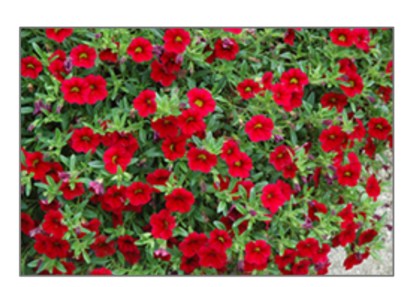
MiniFamous Vampire Calibrachoa flowers