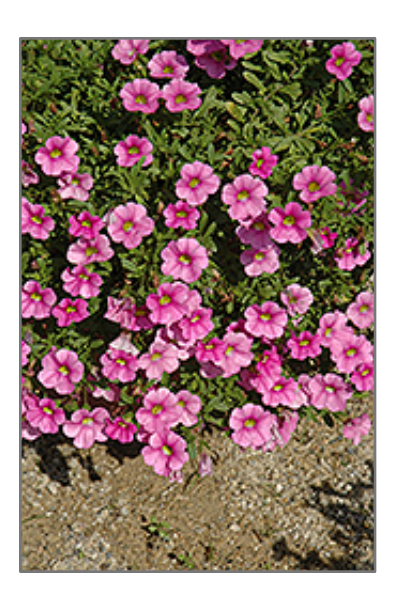
Noa Ultimate Pink Calibrachoa flowers

Large brightly colored flowers bloom on this mounded-semi trailing series; continuous blooming from late spring to first frost; fast growing and low maintenance, ideal for patio containers, hanging baskets and window boxes; excellent heat tolerance