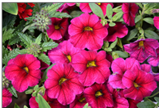
Superbells Cherry Red Calibrachoa flowers