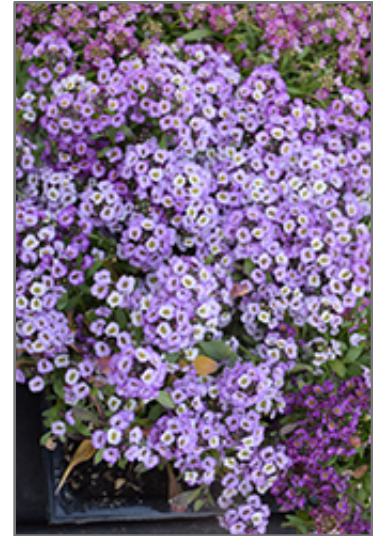
Clear Crystal Lavender Shades Sweet Alyssum flowers

Clear Crystal Lavender Shades Sweet Alyssum is recommended for the following landscape applications;