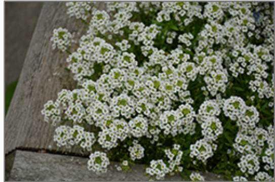
Snow Princess Alyssum flowers

Snow Princess Alyssum is recommended for the following landscape applications;