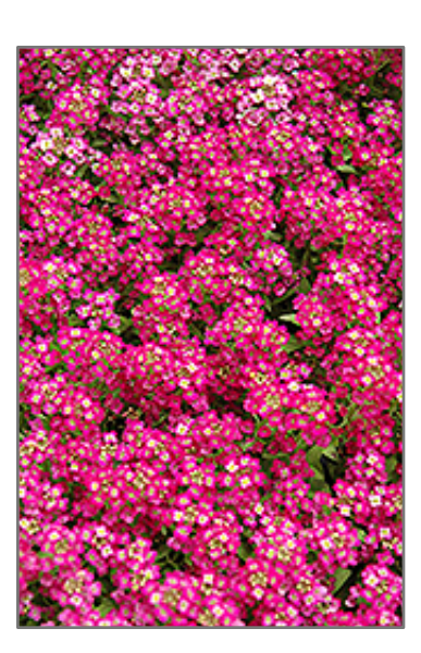
Wonderland Deep Rose Alyssum flowers

Wonderland Deep Rose Alyssum is smothered in stunning clusters of fragrant rose star-shaped flowers at the ends of the stems from mid spring to mid fall. Its tiny narrow leaves remain grayish green in colour throughout the season.