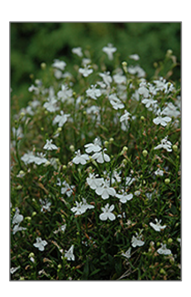
Waterfall White Sparkle Lobelia flowers