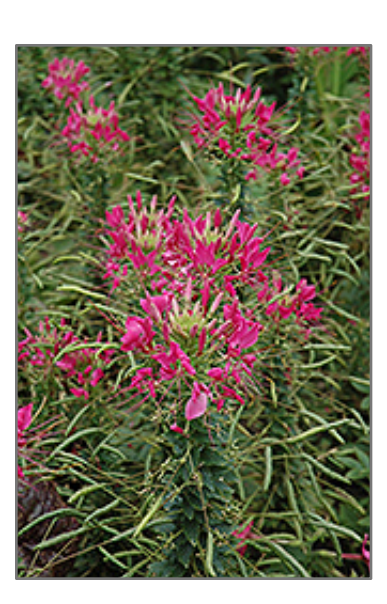
Sparkler Rose Spiderflower flowers

This variety is a fast growing annual that typically may rise to four feet on rigid stems; dense terminal racemes of fragrant, rose pink, spider-like flowers from early summer until frost; tolerates light shade