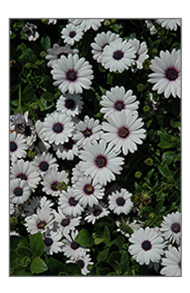
Akila White African Daisy flowers

Full, well branched plants producing multitudes of beautiful white flowers with dark purple centers; drought tolerant once established; a great choice for mass plantings and containers