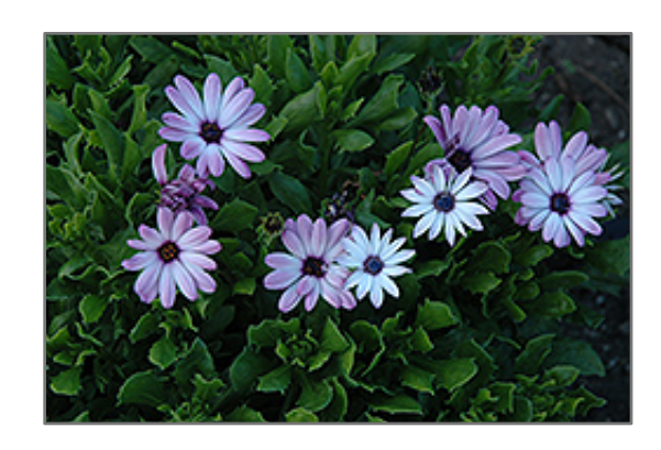
Asti Purple Bicolor African Daisy flowers

Hardiness Zone: (annual) Group/Class: Asti Series