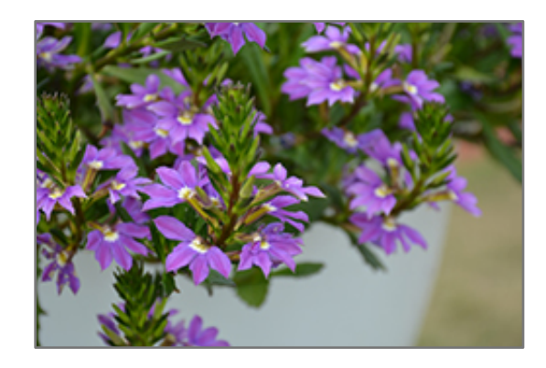
Blue Haze Fan Flower flowers

Hardiness Zone: (annual) Group/Class: Blue Series