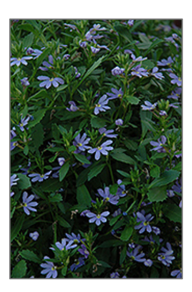
Blue Print Fan Flower flowers

Blue Print Fan Flower features dainty sky blue flowers with yellow eyes along the stems from mid spring to late summer. Its small serrated oval leaves remain dark green in colour throughout the season.