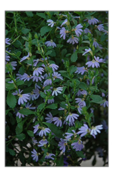
Blue Ribbon Fan Flower flowers

Blue Ribbon Fan Flower features dainty lavender flowers with sky blue overtones along the stems from mid spring to late summer. Its small serrated oval leaves remain dark green in colour throughout the season.