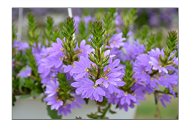
Blue Sea Fan Flower flowers

Hardiness Zone: (annual) Group/Class: Blue Series