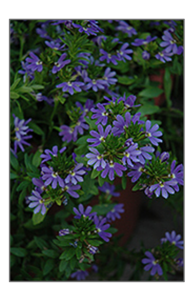
Blue Wind Fan Flower flowers

Blue Wind Fan Flower features dainty royal blue flowers with sky blue overtones along the stems from mid spring to late summer. Its small serrated oval leaves remain dark green in colour throughout the season.