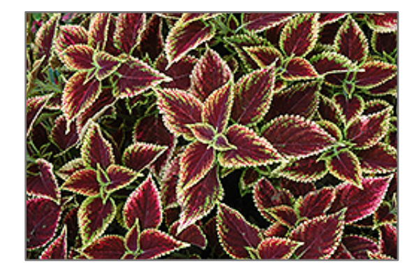
Beckwith's Gem Coleus foliage