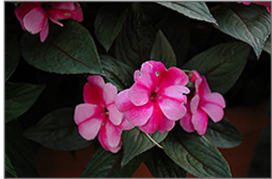
Celebration Purple Star New Guinea Impatiens flowers

Celebration Purple Star New Guinea Impatiens is recommended for the following landscape applications;