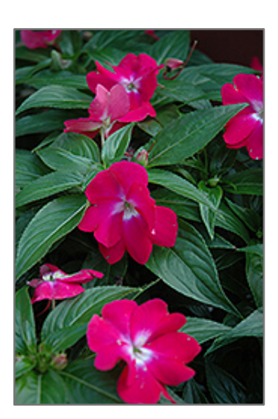
Celebration Raspberry Rose New Guinea Impatiens flowers

A vigorous and well branched mounded variety with excellent shade and heat tolerance; large, vibrant blooms attract butterflies and hummingbirds; no pruning or deadheading required; excellent choice for beds, borders or large containers