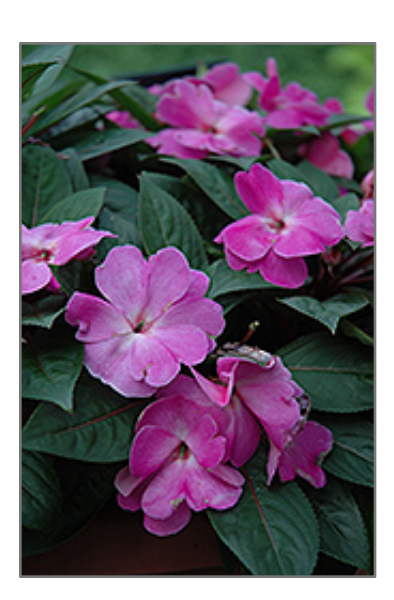
Celebrette Orchid New Guinea Impatiens flowers

A lovely self-cleaning variety needing little to no maintenance, perfect for garden beds, borders and containers; well branched, mounded habit with excellent shade tolerance; large, vibrant flowers nestle atop deep green foliage on compact plants