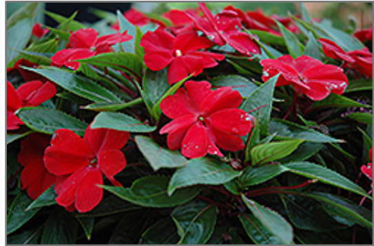
Celebrette Red New Guinea Impatiens flowers

Celebrette Red New Guinea Impatiens is recommended for the following landscape applications;