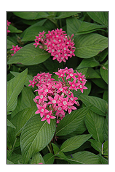
Egyptian Star Flower flowers

Egyptian Star Flower features showy corymbs of cherry red star-shaped flowers with lilac purple overtones at the ends of the stems from late spring to early fall. Its large textured pointy leaves remain forest green in colour throughout the year.