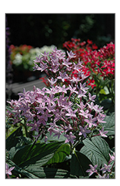
Butterfly Blue Star Flower flowers

Butterfly Blue Star Flower features showy corymbs of lilac purple star-shaped flowers at the ends of the stems from late spring to early fall. Its large textured pointy leaves remain forest green in colour throughout the year.