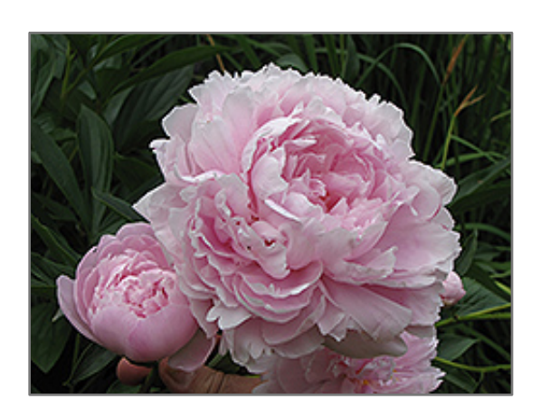
Double Pink Peony flowers

This luxurious peony will create a dramatic late spring display in garden and border plantings; the buds open to reveal stunning, soft pink blooms with slight hints of lavender; the fragrant flowers open on stiff stems making them an excellent cut flower