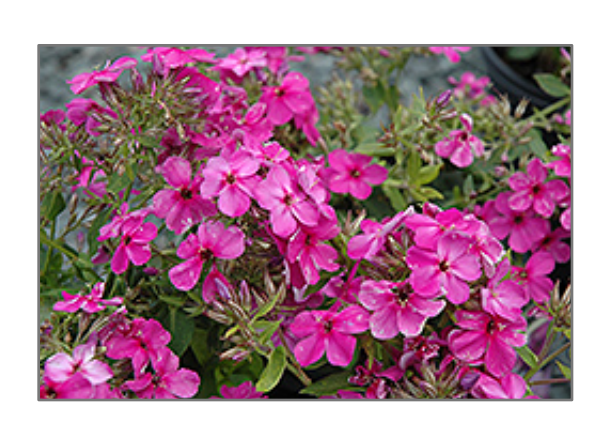
Early Start Velvet Garden Phlox flowers

An early starting variety producing blooms of fragrant violet cast flowers with darker centres, on compact plants suitable for containers or small perennial borders; good mildew resistance