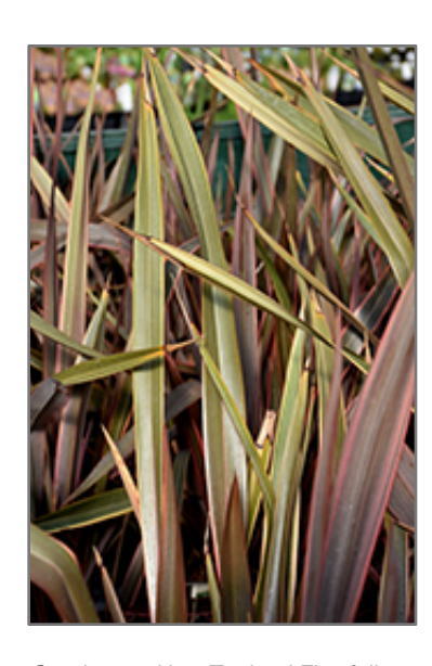
Sundowner New Zealand Flax foliage