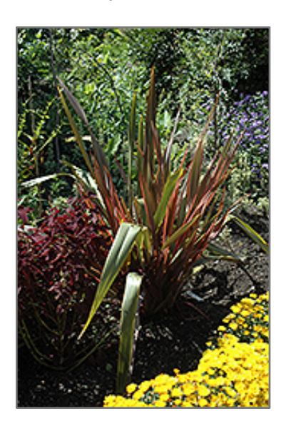
Sundowner New Zealand Flax