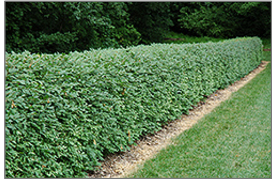
Winged Burning Bush

This shrub performs well in both full sun and full shade. It is very adaptable to both dry and moist locations, and should do just fine under average home landscape conditions. It is not particular as to soil type or pH. It is highly tolerant of urban pollution and will even thrive in inner city environments. This species is not originally from North America.