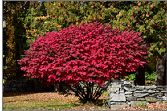
Winged Burning Bush in fall

Winged Burning Bush is recommended for the following landscape applications;