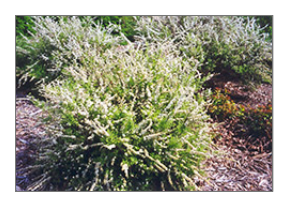
Dwarf Garland Spirea in bloom

A compact ball-shaped shrub featuring gracefully arching branches smothered in striking snow-white flowers in spring, keeps tidy the rest of the year, low maintenance; beautiful in a small garden or shrub border; full sun and well-drained soil