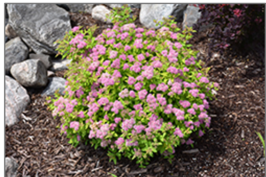
Dakota Goldcharm Spirea in bloom