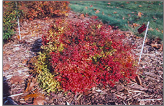
Dakota Goldcharm Spirea in fall

This shrub should only be grown in full sunlight. It prefers to grow in average to moist conditions, and shouldn't be allowed to dry out. It is not particular as to soil type or pH. It is highly tolerant of urban pollution and will even thrive in inner city environments. This is a selected variety of a species not originally from North America.